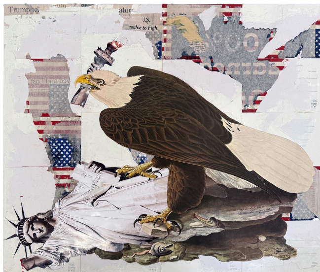
Phyllis Famiglietti American Tragedy 16" x 12" Analogue Collage