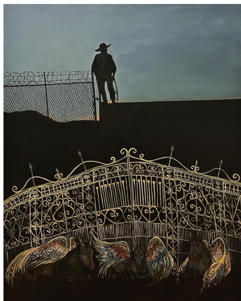
Rosa Booth (Cowboy Series) The Wall 36" x 48" Slow Drying Acrylic On view "Reclamation/Declaration" at Stonybrook Arts (#1 on the map)